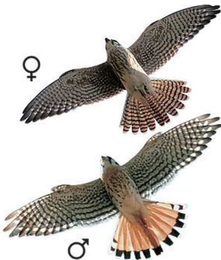
Female and Male Plumage from below