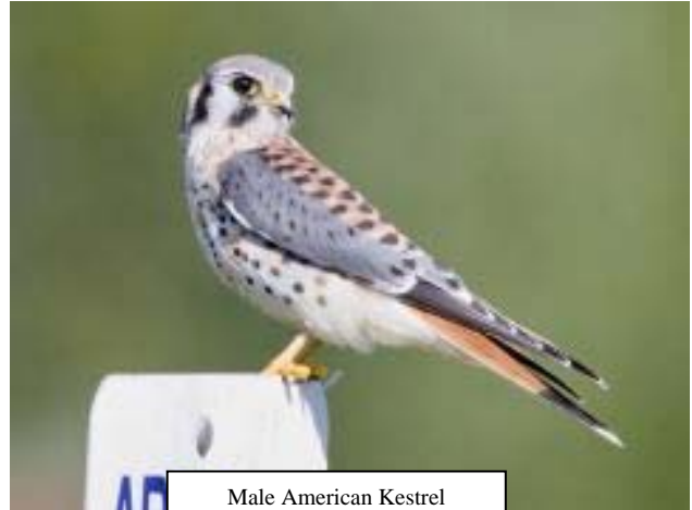
Male American Kestrel © Jim Gilbert

Kestrels are both sexually dimorphic and dichromatic; therefore sexing can be done at a distance and in chicks as young as three weeks (Hawk Mountain n.d.). Males are on average 10% smaller than females though this may be hard to ascertain in the field (Hawk Mountain 1997, Smallwood & Bird 2002). Males are more colorful, with bluish-gray wings (with or without black barring) and rufous (reddish-brown) tails. A single black bar tipped in white extends across the terminal end of the largely unmarked tail. Females are rufous on their wings and tails, often with multiple black bars extending horizontally along the length (Hawk Mountain n.d.). Plumage is highly variable among individuals (Smallwood & Bird 2002). Both sexes exhibit grayish crowns and rufous crown patches with two vertical black stripes down their white cheeks. Black “eyespot” on the back of their heads are thought to aid in reducing predation on kestrels by larger birds of prey- giving the illusion of predator awareness. Males and females both have large, dark, yellowish-orange rimmed eyes and small hooked beaks. They have medium-long tails and long wings that reach almost to the end of their tails when folded. In flight, their wings are long and sickle-shaped (Hawk Mountain 1997). They typically vocalize “ klee klee klee klee ” in a high pitched and rapid succession (Hawk Mountain n.d.).