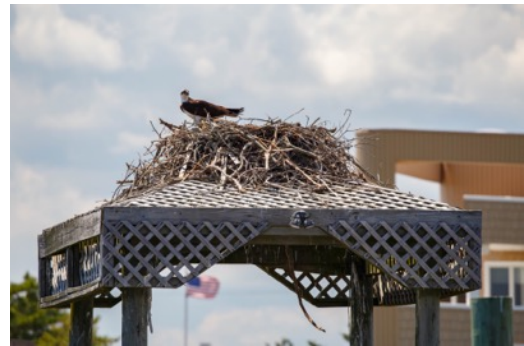
A new nest in High Bar Harbor, N.J.

As with previous years' surveys, all major nesting colonies, along the Atlantic Coast and Delaware Bay, were surveyed by specially trained volunteers and staff from late June to mid-July. In 2017, a total of 668 active nests were recorded, a new all-time state record, up from 542 recorded during the last census in 2013. Nest outcome was determined in 78% of the active nests surveyed, 449 on the Atlantic Coast and 70 along the Delaware Bay. With this data, we can calculate the productivity rate, which is a measure of the health of the population. In 2017, the statewide productivity averaged 1.72 young/active (known-outcome) nest, down slightly from 2016 (1.78), but consistent with what we've observed over the past decade. The Delaware Bay productivity remained above the Atlantic Coast average at 2.01 vs. 1.67 young/nest, both well above the minimum of 0.8 young/nest to maintain the population.