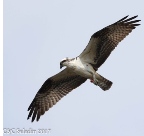
Osprey 25/H: Banded on July 9 off LBI. Photographed in Cape May on Oct. 8, 2017 by C&C Saladin.

Around 72% of all ospreys nesting in New Jersey rely on these man-made nesting platforms. It is our mission to ensure that these platforms are maintained to ensure ospreys have secure sites to nest and raise their young. It is extremely important that everyone who wants to help ospreys, follow our nest platform plans to ensure that the structure is built to withstand the harsh weather conditions found along the coast of New Jersey.