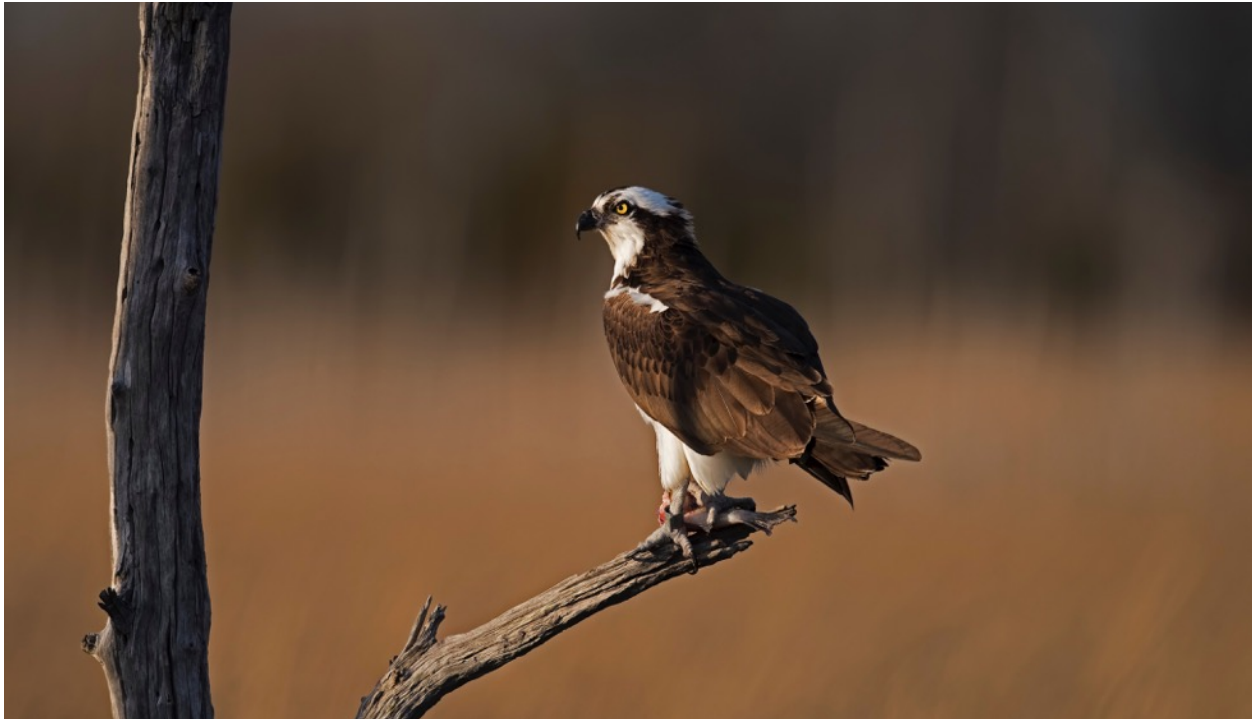
Sixteen year old male osprey (band # 788-45514) who nests on the Delaware Bay. April 2017.