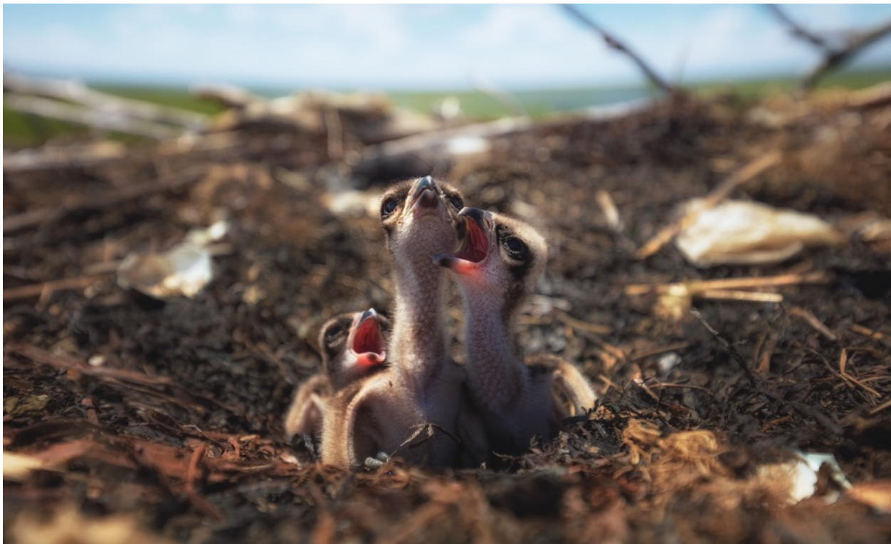
Three osprey hatchlings in their nest on Barnegat Bay.