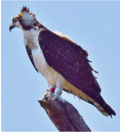
Osprey 79/D: Banded on July 5 behind LBIF in Loveladies, NJ.